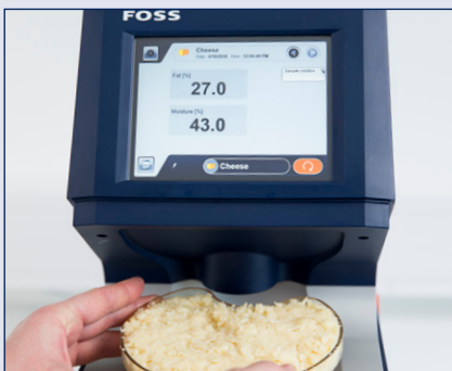
1. Place sample