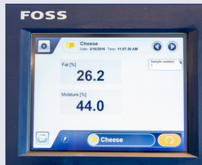
3. Check the results on the screen