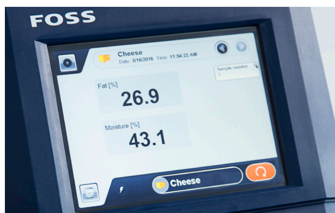
All result data is recorded for backup and traceability

Robust construction coupled with ongoing FOSS local support makes it an easy-to-own solution.