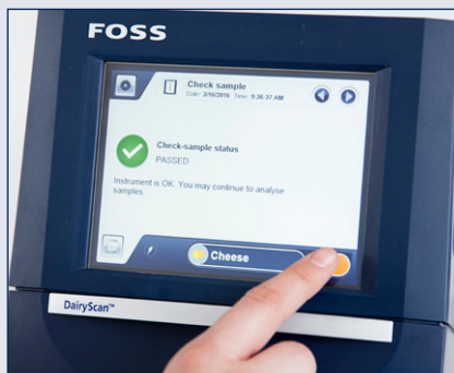
2. Press start