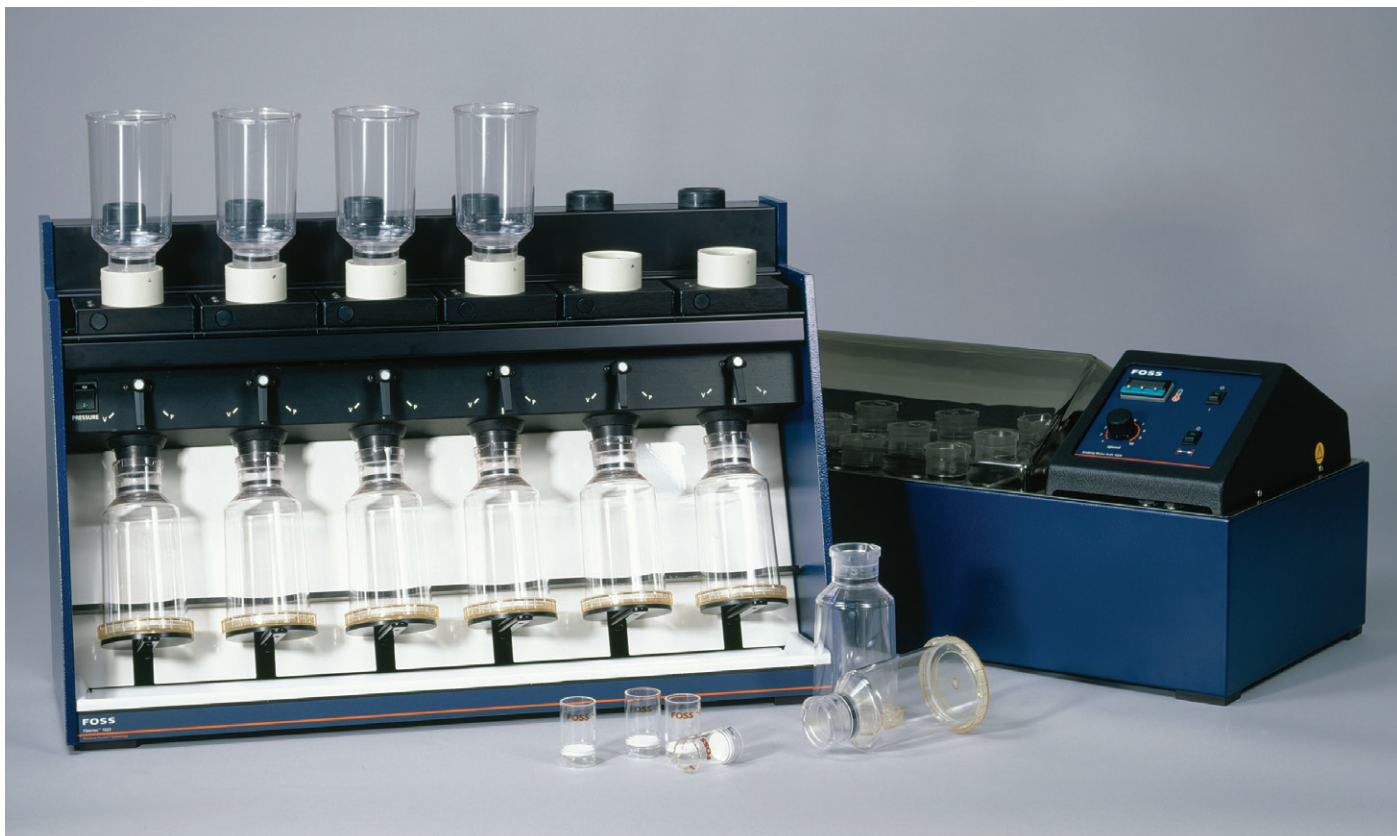
Semi-automated incubation and filtration system for quantitative determination of dietary fibre* in food, cereals, fruit and vegetables. *Note. A Boiling Water Bath, not supplied, is required for estimation of dietary fibre