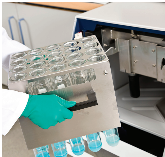
Just load your sample racks directly from the digestion block and Kjeltec™ will perform accurate analysis unattended for more than four hours.